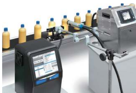
PK410+CCS3000L Setting Image

Most suitable for use in a long term non-stop operation.