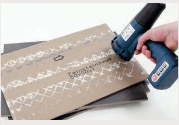
Ceramic printed with black universal ink (ethanol); metal spacing wheels for better grip.