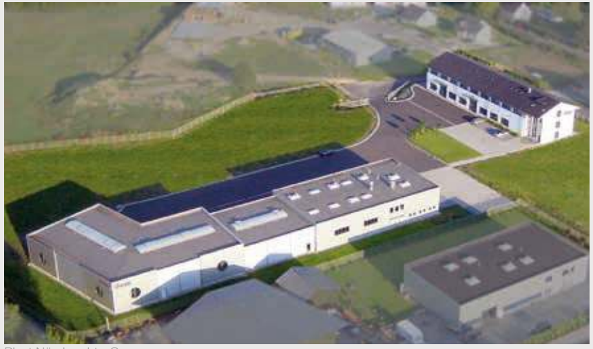
Plant Nümbrecht - Germany