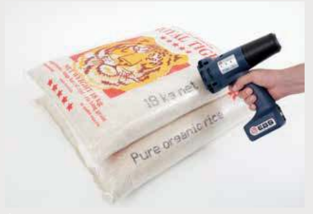
Super Sacks (PE) printed with black quick-drying ink (acetone); large spacing wheels.