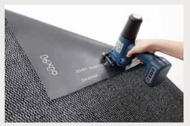
Rubber printed with white pigmented ink (ethanol); 4-wheel stabilizer.