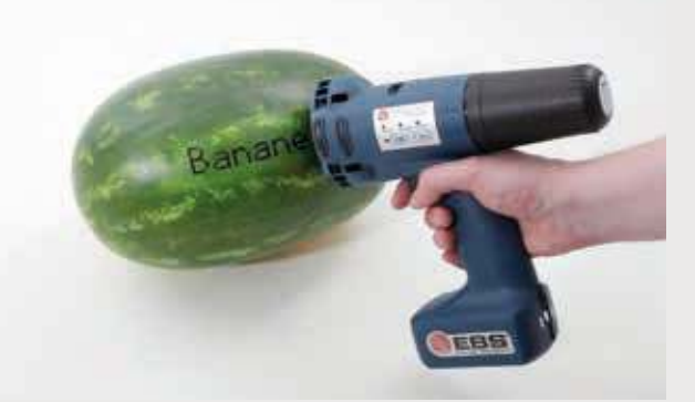
Food Stuffs printed with brown food grade ink (water/ethanol); large spacing wheels.