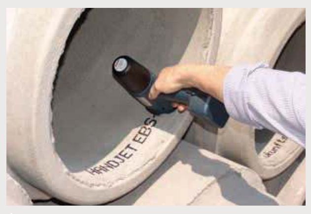
Concrete printed with special ink for stronger UV resistance; large spacing wheels.