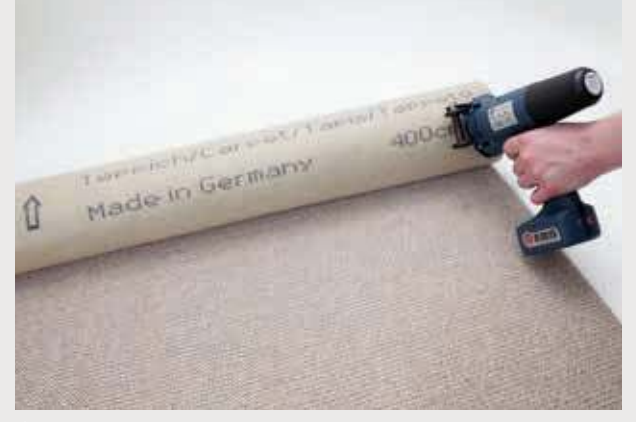
Carpeting printed with black universal ink (ethanol); 4-wheel stabilizer.