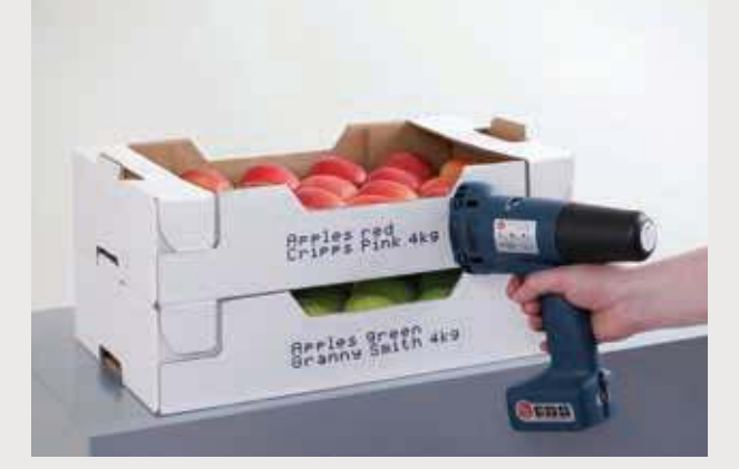
Cardboard printed with black universal ink (ethanol).