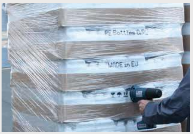
Stretch Film printed with black universal ink (ethanol); large spacing wheels.