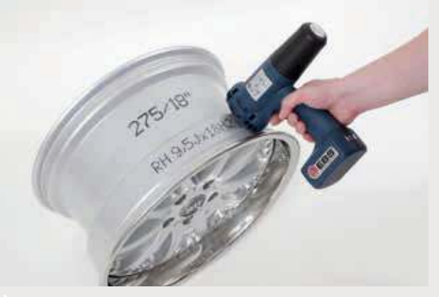
Aluminium printed with quick-drying ink (acetone); large spacing wheels.