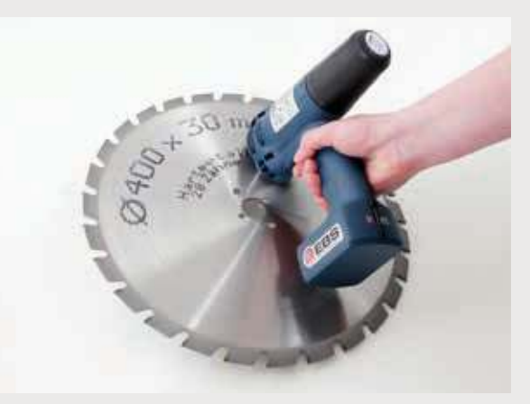
Tool Steel printed with black universal ink (ethanol); metal spacing wheels for better grip.