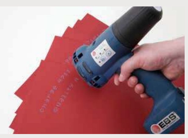
Leather (imitation) printed with blue pigmented ink (MEK).