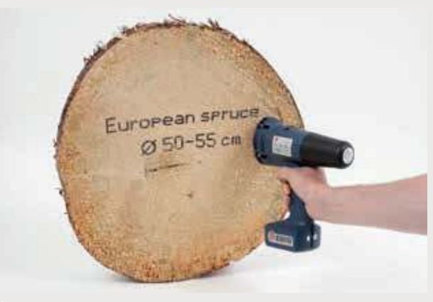
Cut wood printed with black universal ink (ethanol); large spacing wheels.